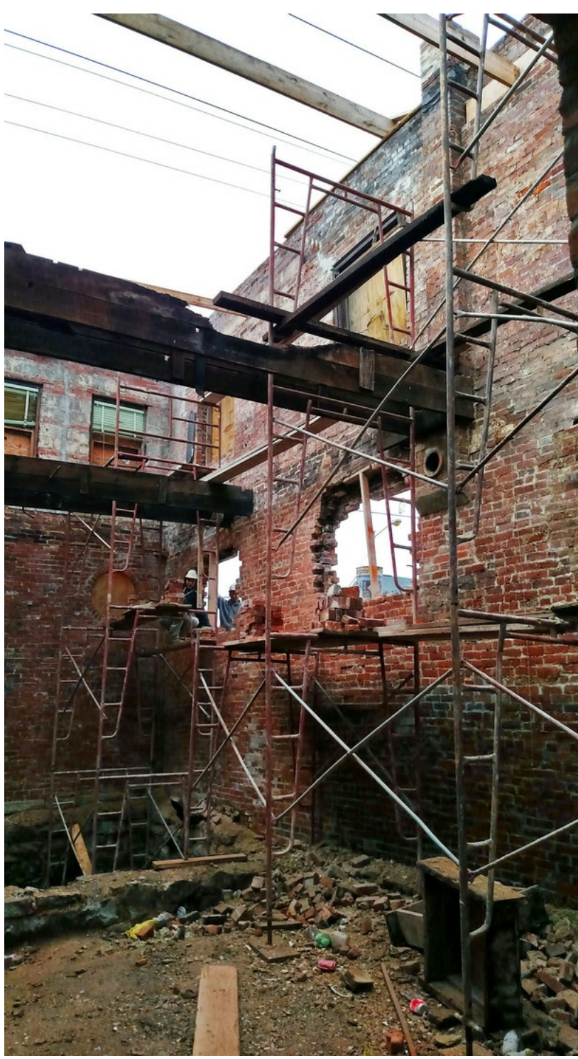
A look inside the building on Jo Johnston Ave. when the restoration work began.